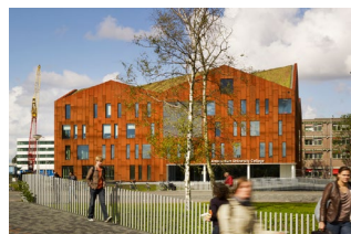
Amsterdam University College, NL