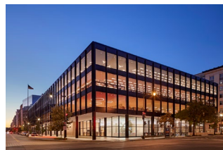
Martin Luther King Jr. Memorial Library, Washington D.C., US