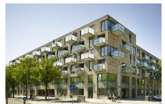
Osdorp Mixed-use Centre and Housing, Amsterdam, NL