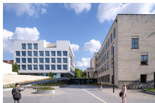
Heerlen City Hall and Municipal Offices, NL